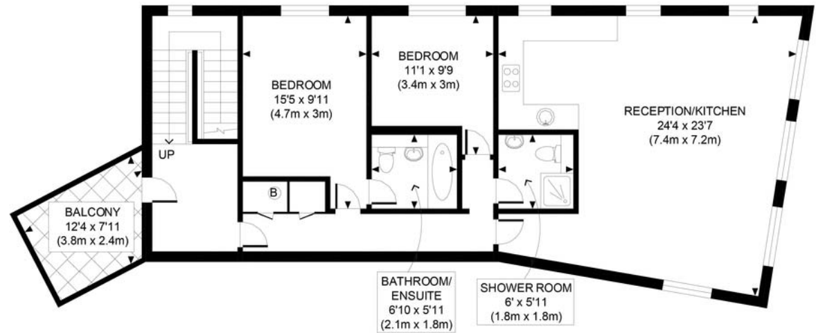
SECOND FLOOR GROSS INTERNAL FLOOR AREA 991 SQ FT

APPROX. GROSS INTERNAL FLOOR AREA 1067 SQ FT / 99 SQM